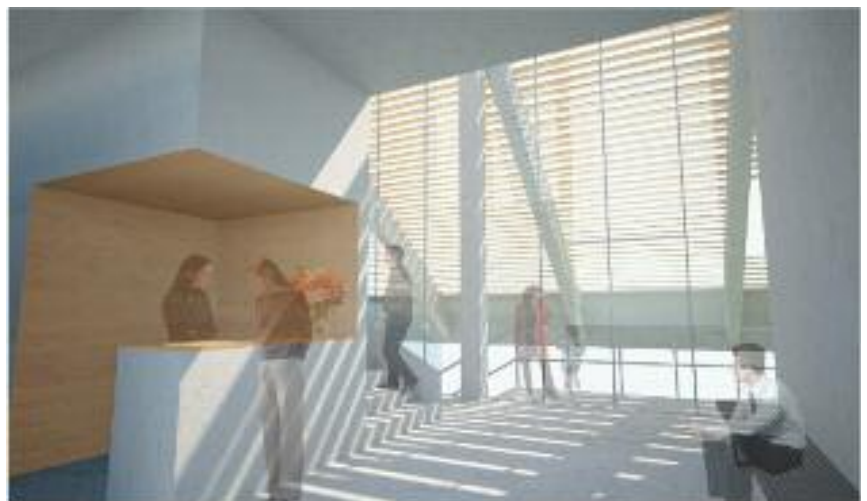
Entrance Lobby View

To begin with, the clubhouse shall accommodate SJS alumni entrepreneurs in need of a development and launch platform for their business ideas. Furnished with small yet fully equipped cubic offices (Internet, Phone, Fax, Copiers, etc.), the clubhouse provides alumni with instant startup resources and business support. This is also of significant importance to alumni who are based abroad; they could tremendously benefit from the existence of such a connected business center for their operations while visiting Lebanon.