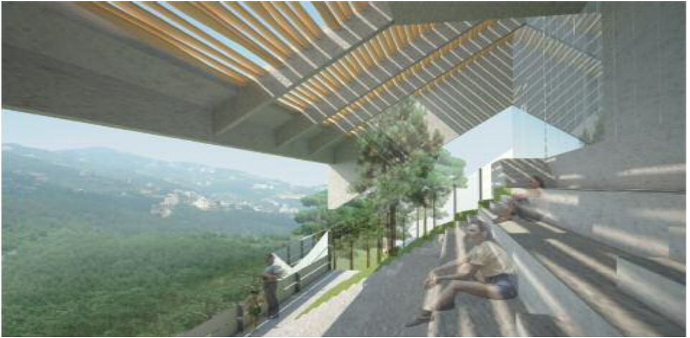
View of Covered Outdoor Seating Area

On a related note, the clubhouse features a roofed, outdoor amphitheater that can be used for general meet-